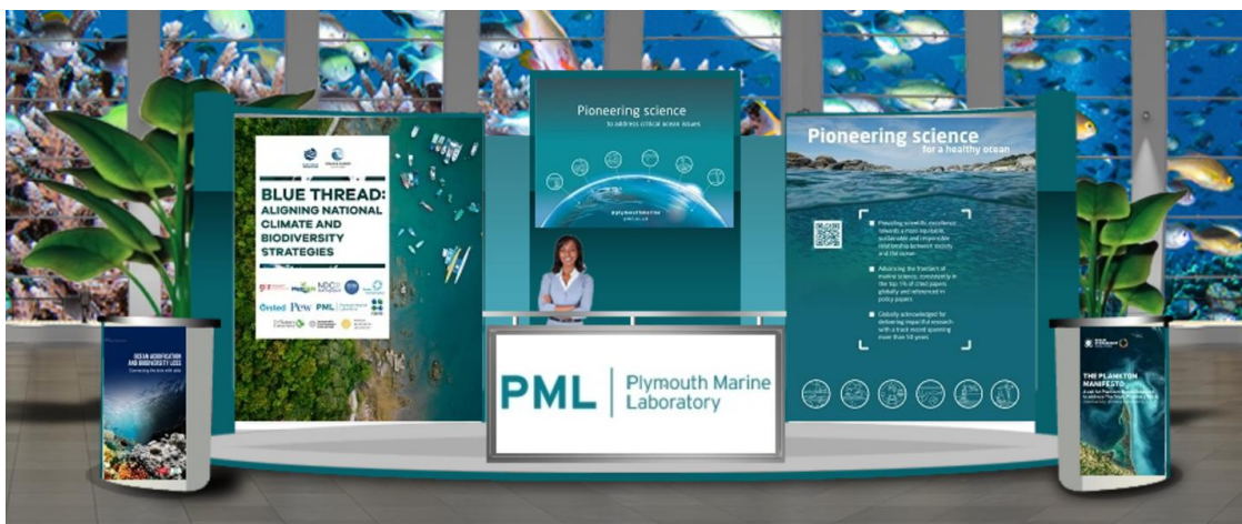
Exhibit Spotlight: Plymouth Marine Laboratory